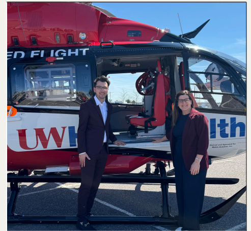
WI HOSA State Management Team w/UW-Health MedFlight at SLC 2026